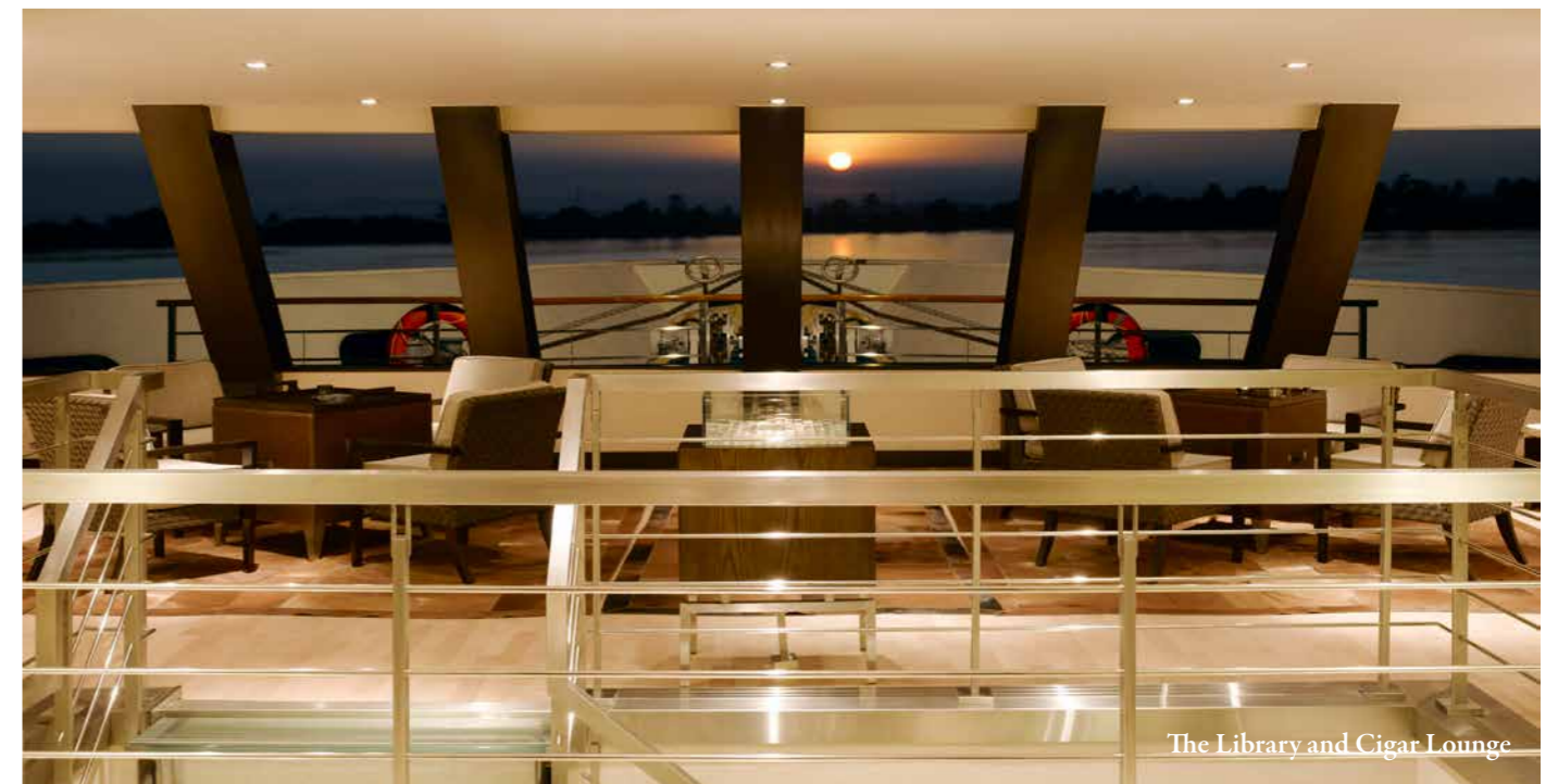
The Library and Cigar Lounge