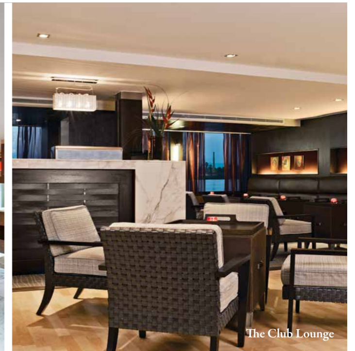
The Club Lounge