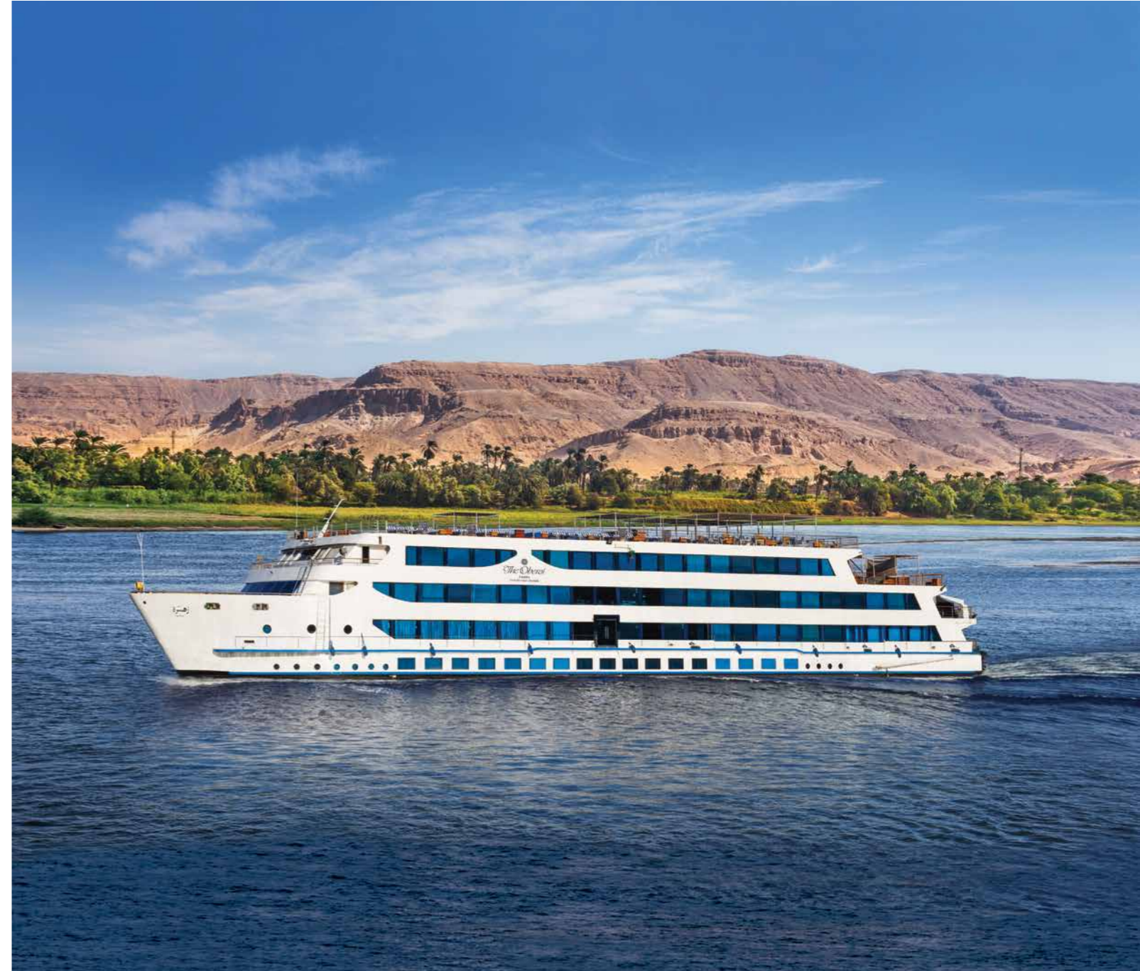
The Oberoi Zahra, Luxury Nile Cruiser route map

At the spa on board The Oberoi Zahra, Luxury Nile Cruiser, therapists well versed in the art of imparting wellness will guide you through elevating experiences that result in reduced stress, skin revitalisation and relaxation; holistic treatments that draw on Eastern and Western massage techniques. Perfectly complemented with River Nile views.